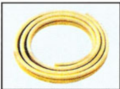
Air hose Length : 60"